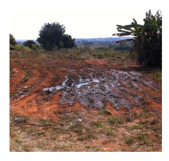
Photograph 1. Use of untreated Faecal Sludge in gardens

adenovirus, enteric adenovirus types 40 and 41, enterovirus types 68-71, hepatitis A and E, poliovirus and rotavirus. These cause enteritis, meningitis, encephalitis, paralysis, hepatitis and poliomyelitis. (iii) parasitic protozoa namely Cryptosporidium parvum, Cyclospora histolytica, Entamoeba histolytica and Giardia intestinalis which cause cryptosporidiosis, amoebiosis and giardiasis. (iv) helminths like Ascaris lumbricoides, Taenia solium/ saginata, Trichuris trichura, hookworm and Schistosoma spp. which cause enteritis, taeniasis, trichuriasis, anaemia and schistosomiasis. The effects of these ailments cant not overemphasised as some can even be fatal if left untreated.