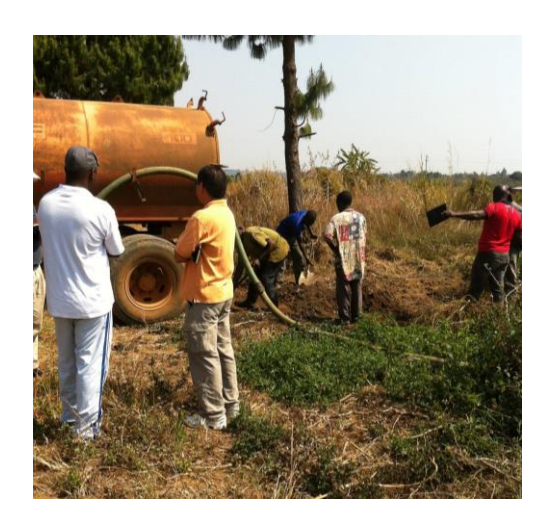
Photograph 2. A privately operated vacuum tanker collecting dry sludge they had previously damped indiscriminately